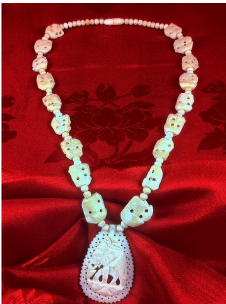
Bone necklace donated and blessed by Tenzin Wangyal Rinpoche

Participants can bid on a range of items, including: