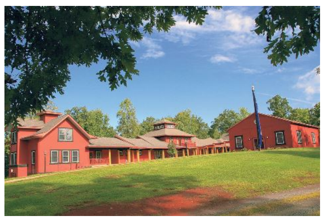
Serenity Ridge Retreat Center

Join us at Serenity Ridge on June 18–23, 2017, for a special service retreat prior to the annual <u>Summer Retreat</u>