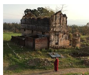
Ruins on the Lishu property