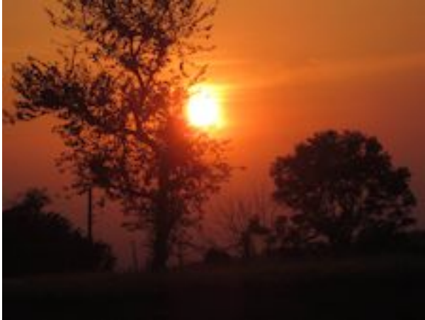
Sunset at Lishu Institute

Everyone lives and practices together in one building at Lishu Institute, which sits atop a small hill above the farming village of Kotra Kalyanpur like a tower, with sights and sounds rising up from below. Teachers, staff and guests lived on the third floor, while we students lived on the second floor below them. I could hear the quiet sounds of morning prayers when an honored guest stayed above my room, or people practicing in the meditation hall or their rooms. A pair of blackbirds would tap loudly at the window above my balcony door each morning at exactly 6:30 a.m., and the sounds of cuckoos, parakeets and other birds were plentiful throughout the day, often joined by the mooing of cows. From our balconies we would wave down at the nearby villagers cutting their wheat with sickles. Most are practicing Hindus, and frequently we heard their drumming and singing during prayers, festivals and weddings. I enjoyed taking my mala up to the west side of the roof each evening to recite Ngondro mantras before dinner. Up there on the Lishu Institute roof I could watch the sun setting most evenings, red and sinking behind the clouds. I watched the colors change as the evening turned to darkness, peaceful sounds of creatures and earth calming, coming in for the night to rest.