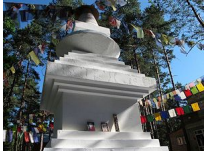
Stupa in Chamma Ling Poland

teachings have developed and thrived in Poland. This August celebrates the 20th anniversary of Bon teachings in Poland.