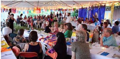
Summer Retreat feast and talent presentation.

Participants who attended this year's Summer Retreat, on the topic of "Dream Yoga," share some photos and poetry from the retreat.