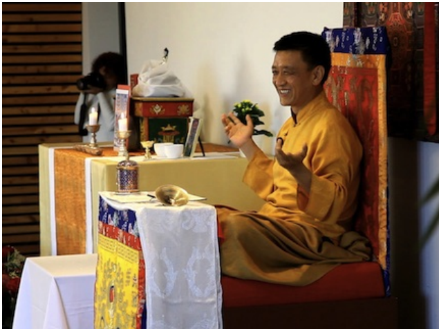
Rinpoche teaches in Austria